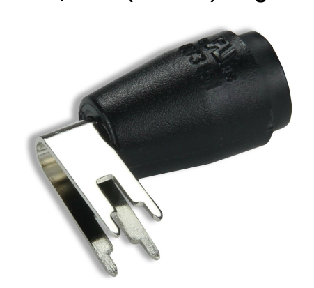
Click Images For Larger Photo