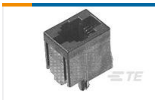
TE Part #216546-1 4/4 PCB MOD.JACK TE