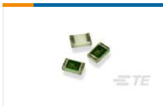
TE Part #8-1879336-3 CPF 0603 1K65 1% 50PPM 1K RL