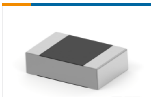
TE Part #1-2176264-0 RN 0805 634K 0.1% 10PPM 1K RL