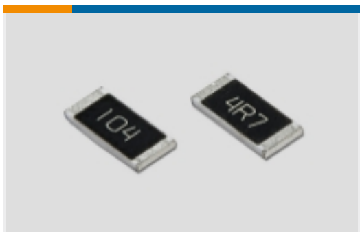
Surface Mount Resistors(545)