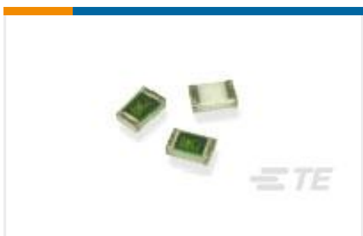
TE Part #1676299-2 RN 0805 309R 0.1% 10PPM 1KRL