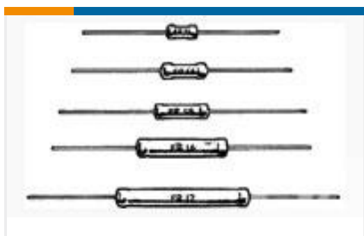
TE Part #1623747-9 ER74 18R 5% AMMO PK