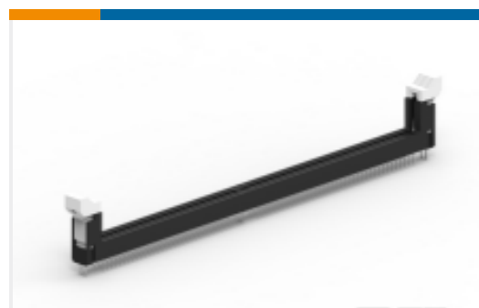
TE Part #2-2308107-1 DDR4 DIMM 288 PIN TH TYPE