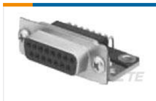
TE Part #5745115-2 37 RCPT RA/MS STD